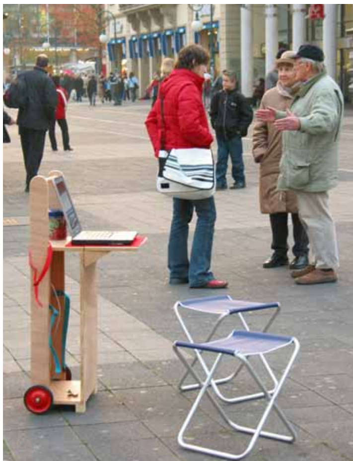
Collecting memories in the Kassel city centre, November 2004

In order to inform the general public about the project and to collect data for the database on location - town centres, railway stations etc. - the Mobile-Info-Module was developed. This consists of a light wooden trolley with a built-in folding table and two folding stools. Carried in a Becoming German Travel Bag a laptop with the database installed on the local hard drive is used to collect data on the road. Data collected in this way is later uploaded onto the live internet database with a specially developed synchronisation software tool.