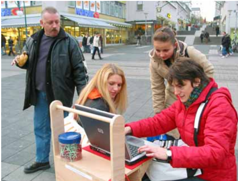
Collecting memories in the Kassel city centre, November 2004

Echoing both the century old tradition of itinerant apprentices in Germany and the wanderings of the Brothers Grimm in their search for Fairy Tales in the early 19th Century I planned to collect data for my project by travelling through Germany and speaking to people on the street. This walkabout with the Mobile-Info-Module enabled a direct exchange between the storyteller and listener in the oral tradition.