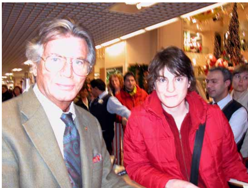
Winnetou and I, Galeria Kaufhof, Cologne, 2004

The aim of the internet database "Becoming German" is to provide a digital source of information and assistance to those who do not have a German childhood and would like to "become German" or for those who would simply like to have a different German childhood.