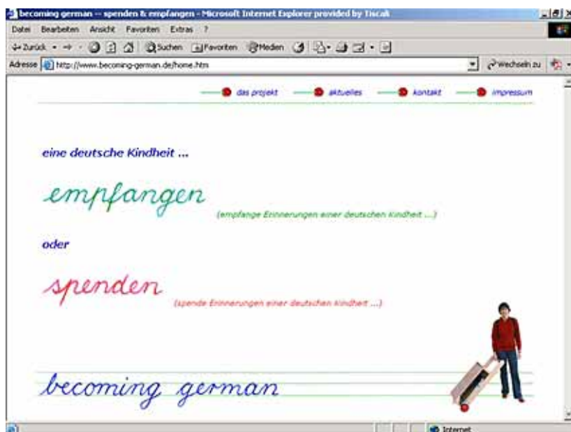
Screenshot der Internet-Datenbank "becoming german" www.becoming-german.de

The database can be found in the internet at: www.becoming-german.de