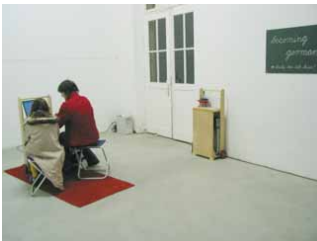
The fixed Info-Point at the Kulturbahnhof, Kassel, November 2004

In an exhibition situation a Becoming German Info-Point is installed in the space. Here visitors can access the database online on laptops connected to the internet. During the exhibition further memories are collected in the town center and the exhibition surroundings. Photographs documenting this walkabout are presented as digital prints in the space. Each day the number of both entries in the database and photos documenting the project grows. In this way the work in process is visualised.